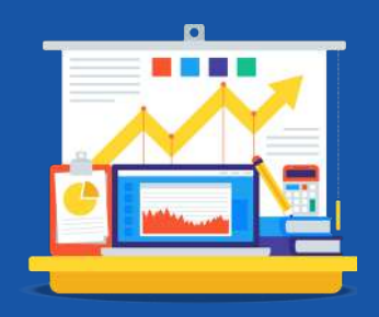
Free Financial Planning

Providing lead creation cashback also. For example: You have a car which needs to be insured every year. And let's assume that your car insurance is Rs 1000/-. You can take benefits for 3 years.