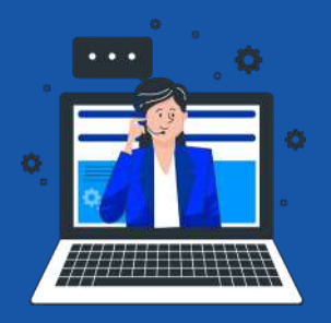
Dedicated Virtual RM

Providing free of cost 'Financial Planning', which market worth is Rs 10000/-