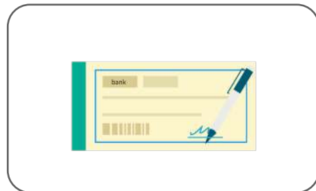
Name Printed Cheque